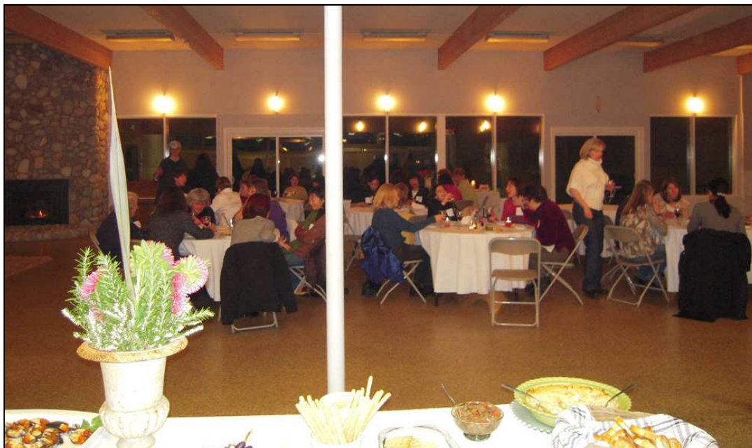
Ladies Night Out

Donuts and juice will be available. For questions, contact Karen Sando @ 546 - 6036